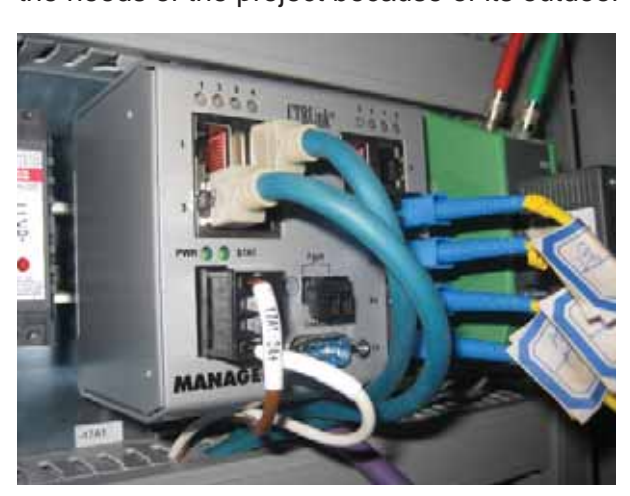
The EISX8M-100T/FCS is a highly compact Ethernet switch. The fiber ring connections are shown on the right.

The Contemporary Controls' EISX compact managed Ethernet switching hub met the needs of the project because of its outdoor temperature rating, its enhanced