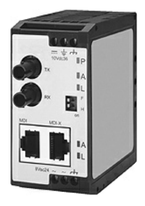
A media converter allows for a simple cnversion from one medium to another such as twisted-pair to fiber.

This is the original twisted-pair standard for Ethernet with operation at 10 Mbps using two twisted-pairs.