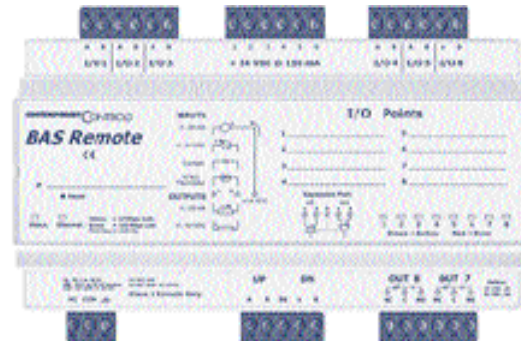
Figure 1—The BAS Remote has six universal input/output points and two relay outputs.

Observing the BAS Remote sitting on a table, it appears in its physical form as a plastic enclosure with screw connectors for powering the unit and for connecting to field devices such as sensors and actuators (see Figure 1). According to the BAS Remote