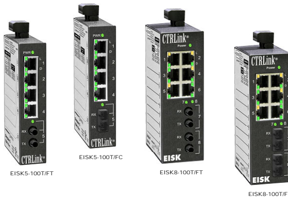
The Skorpion fiber series also includes the EISK5-100T/FC and the EISK8-100T/FC, which support single-mode cable.

The rugged Skorpion 5- and 8-port fiber series provides reliable connectivity for industrial and building automation systems in a cost-effective manner, backed by a 5-year warranty. Fiber ports are used when distances exceed the 100 meter limit of copper, when immunity to EMI/RFI is important or for additional communication security. ST or SC connectors are available for use with (1300 nm) multimode fiber cable or SC connectors with single-mode (1300 nm) fiber cable. All fiber ports operate at 100 Mbps full-duplex.